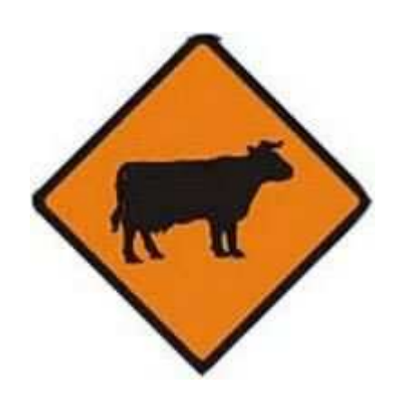
TW 6A HINGED