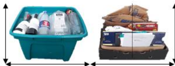
Example of presentation

1 x Crate with recyclables and 1 x bundle of paper/cardboard tied with string. It can be placed either on top of your crate or alongside it. Crates are not to be overflowing and paper/cardboard bundle is to be roughly the same size as your crate.